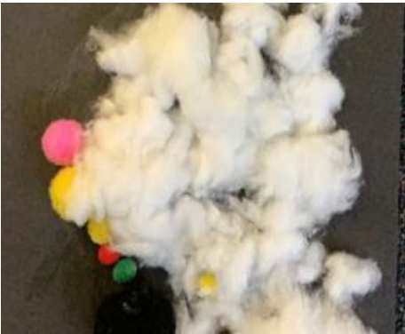
Mya's snowman collage